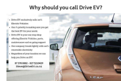
Why should you call Drive EV?

• Drive EV including with each: • 100% Electric Vehicle • 100kms highway range • 120kms round town range • 50kW DC Fast Charging • CHAdeMO • Illuminated nissan emblem • LED Headlights • Rear Camera • Type 1 AC 3.3kW Charging